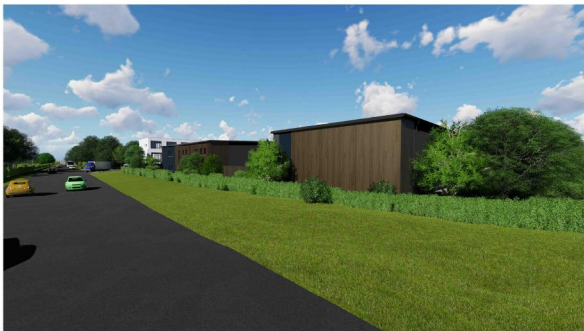
View 3 (low level)