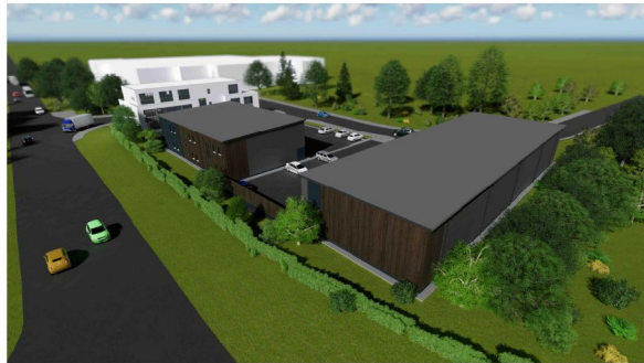
View 2 (high level)