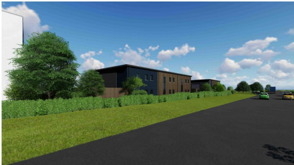
View 1 (low level)